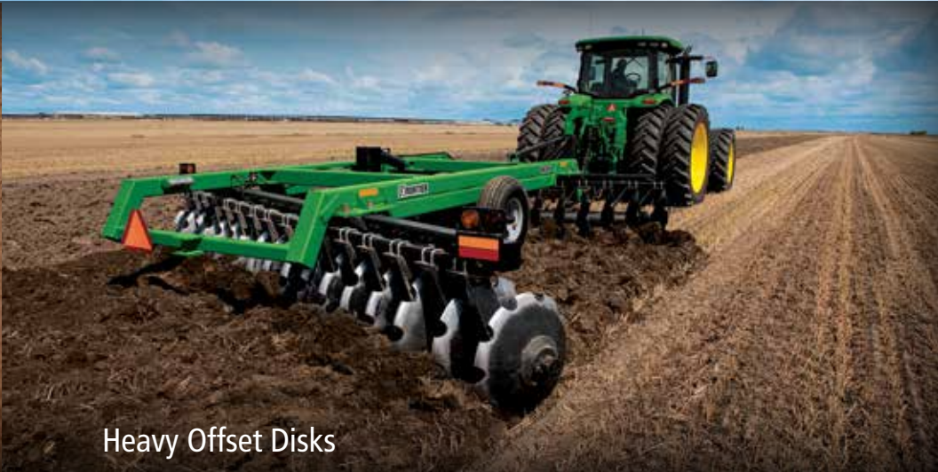
Heavy Offset Disks

TM51 • DH51 • DH52 • DH53 • DH54 • DH55 • DH56 Series