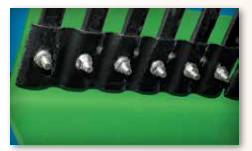
Each steel waffle plate holds six spring steel tines for increased strength and durability.