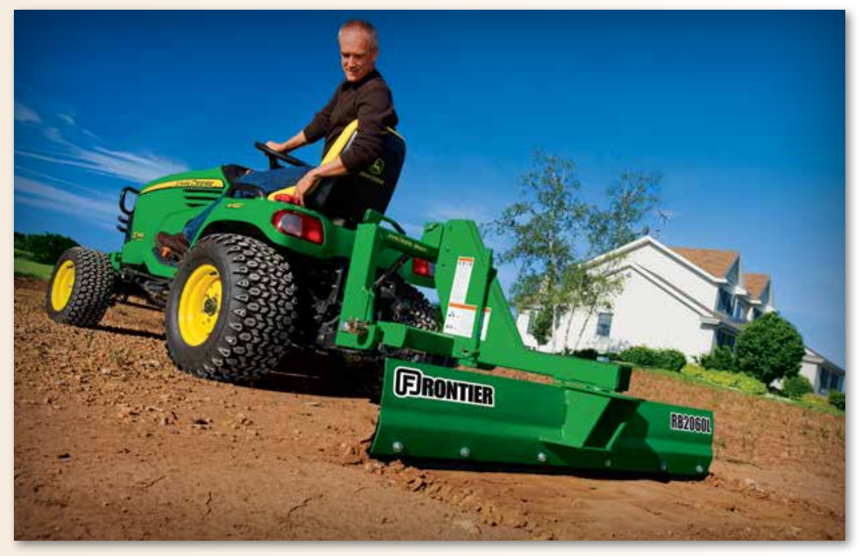
A formed, upper moldboard edge increases rigidity. Moldboard thickness is 3/16-inch for RB2060L and RB2060 and 1/4-inch for RB2072 and RB2084.

*Optional equipment available at an additional cost.