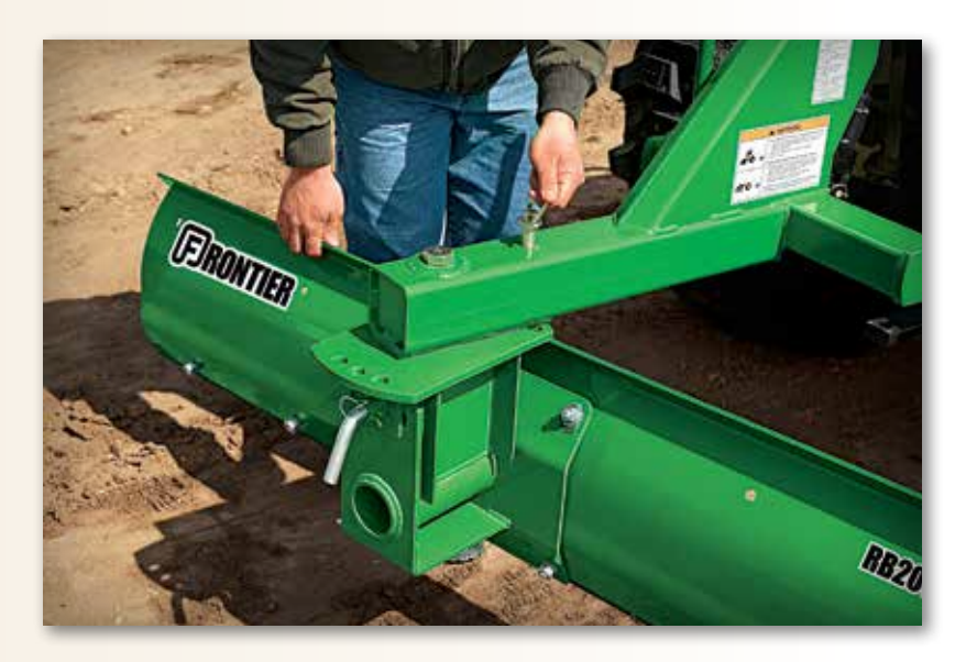
Adjusting the angle is easy. Simply remove the steel pin and rotate the blade to the desired setting, or swing it around for backfilling.

A heavy, welded mast and 4 x 4-inch tubular steel frame (3 x 3-inch on RB2060L) deliver added strength and rigidity. Operator's manual container concealed within mast for added protection.