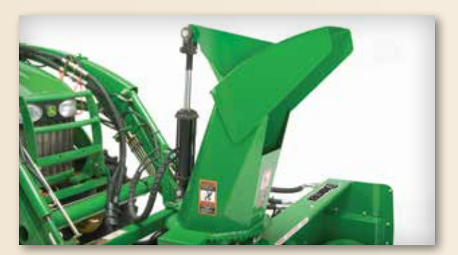
Control the direction of your discharge with quick and easy adjustments to the chute angle. Choose from standard manual chute deflection or optional hydraulic chute deflection (shown above).

U.S.A. www.BuyFrontier.com Canada www.BuyFrontier.ca