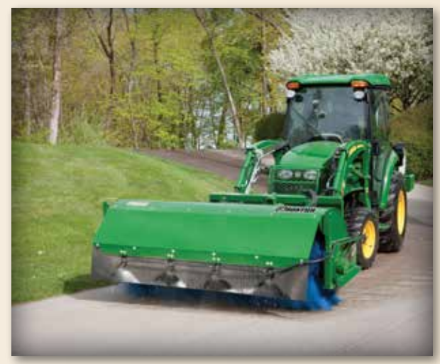
0 to 23 degree left or right angling allows you to windrow material without compromise. And optional gauge wheels let you set the height of the broom to match specific conditions.

Available in 60, 72, and 84 inch (1.63, 1.83, and 2.13 meter) working widths, Frontier Rotary Brooms match up well with John Deere 3 and 4 Family Tractors. They make it easy for homeowners and contractors to keep pavements clear, with options that ensure the simplicity you've come to expect from Frontier. From the high-performance dust suppression system to the adjustable gauge wheels, it's the clean-up tool you've always wanted.