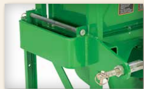
Both hydraulic power packs are designed with a convenient weight bracket to offer additional ballast to the rear of the tractor.

The Hydraulic Power Packs have three attaching points (highlighted, shown at left) for easy and convenient hookup of the dust suppression kit. Also shown with SMV, PTO shaft, and optional oil cooler.