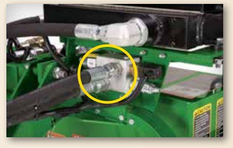
A standard internal thermal switch (highlighted) protects the hydraulic system from overheating, helping save on maintenance costs and minimizing downtime.