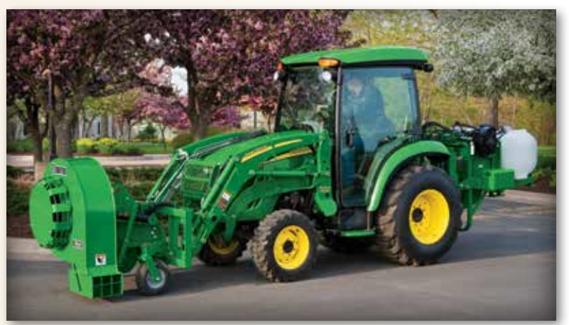
The BL2130 is shown above with the hydraulic power pack's optional oil cooler. Note to customers: The oil cooler option on the hydraulic power pack is recommended to regulate the hydraulic oil temperature.