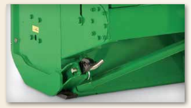
The SB2176 features adjustable skid shoes that minimize gouging on uneven surfaces, and provide added durability for longer wear life.