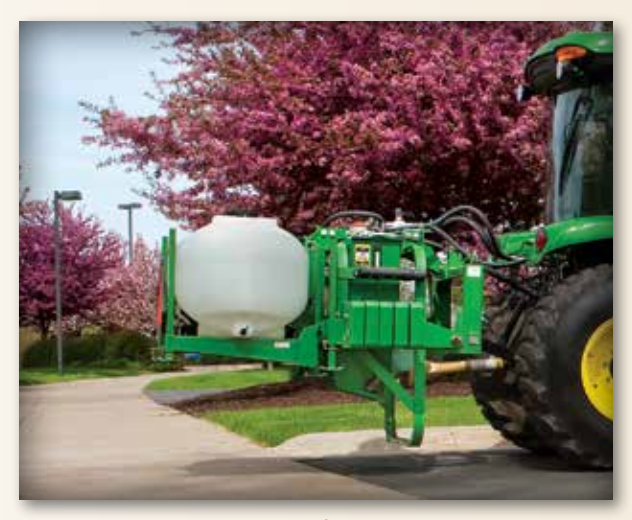
Optional dust suppression system features a large 60 gallon (227.1 liter) tank that pumps out water through nozzles at the front of the broom. The system is easily operated, using a simple rocker switch from the convenience of your tractor seat.