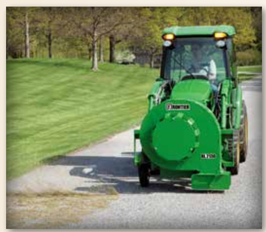
Wide coverage helps you clear more ground. That's less back and forth, saving you time and fuel in your operation.