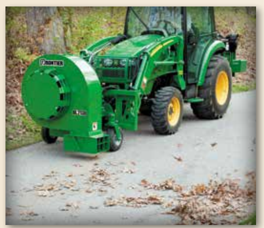
The BL2130 provides 141 mph (226.92 Km/h) maximum air velocity and 6,000 cfm (169.9 m³/min) maximum air flow for greater power when tough jobs approach.