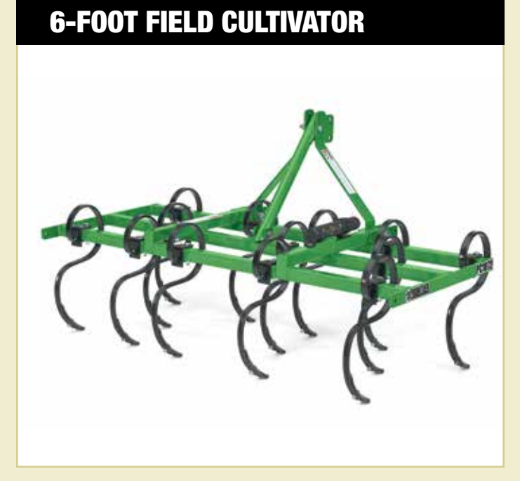
For the small acreage farmer, gardener, or landscaper, attach the Frontier 6-Foot Field Cultivator to your small horsepower machines to prepare seedbeds, bury crop residue, manage weeds, and thoroughly mix soil to ensure proper nutrient distribution in crops.

The Frontier Subsoiler rips hard ground to remove compaction lays and low areas to improve water drainage. With a 1-foot by 6-inch steel shank, the Frontier Subsoiler is adept at breaking up soil, especially if your garden is tilled year after year. Ideal for lower horsepower compact utility tractors.