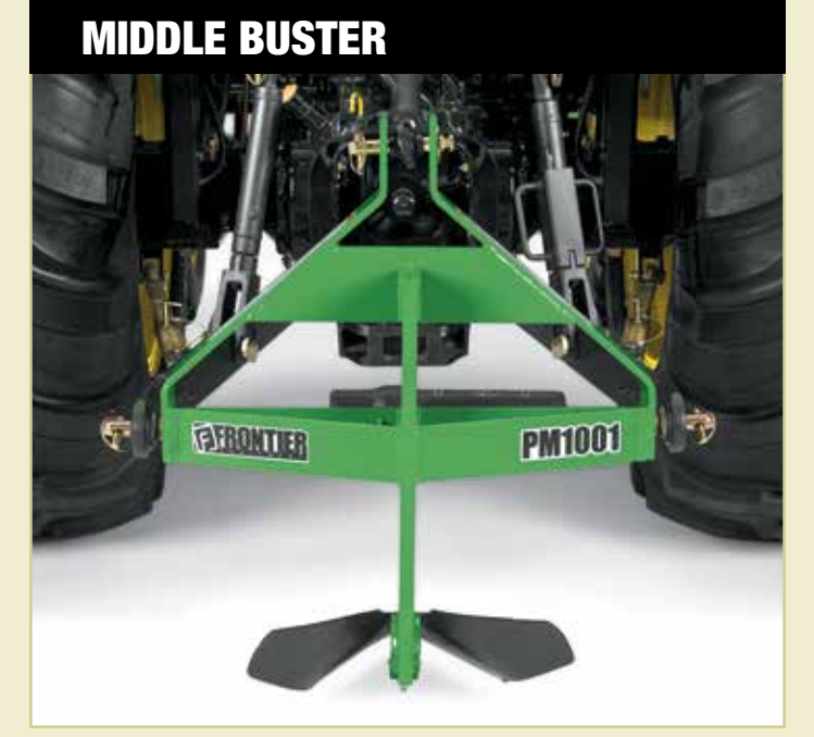
Use the Frontier Middle Buster to create planting beds for produce gardens. Equipped with a 19-inch double-wing cutting blade, the Frontier Middle Buster is perfect for planting vegetables and for digging up potatoes. Hook-up this gardening workhorse to your compact utility tractors with less than 45 HP.