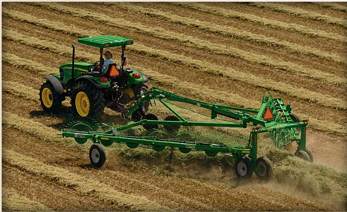
Frontier High-Capacity Wheel Rakes effectively handle heavy crops on rough terrain. Choose models with 12, 14, or 16 wheels.

1 Hour and/or usage limitations may apply. See Warranty for new John Deere Agricultural Equipment or contact your local dealer for details.