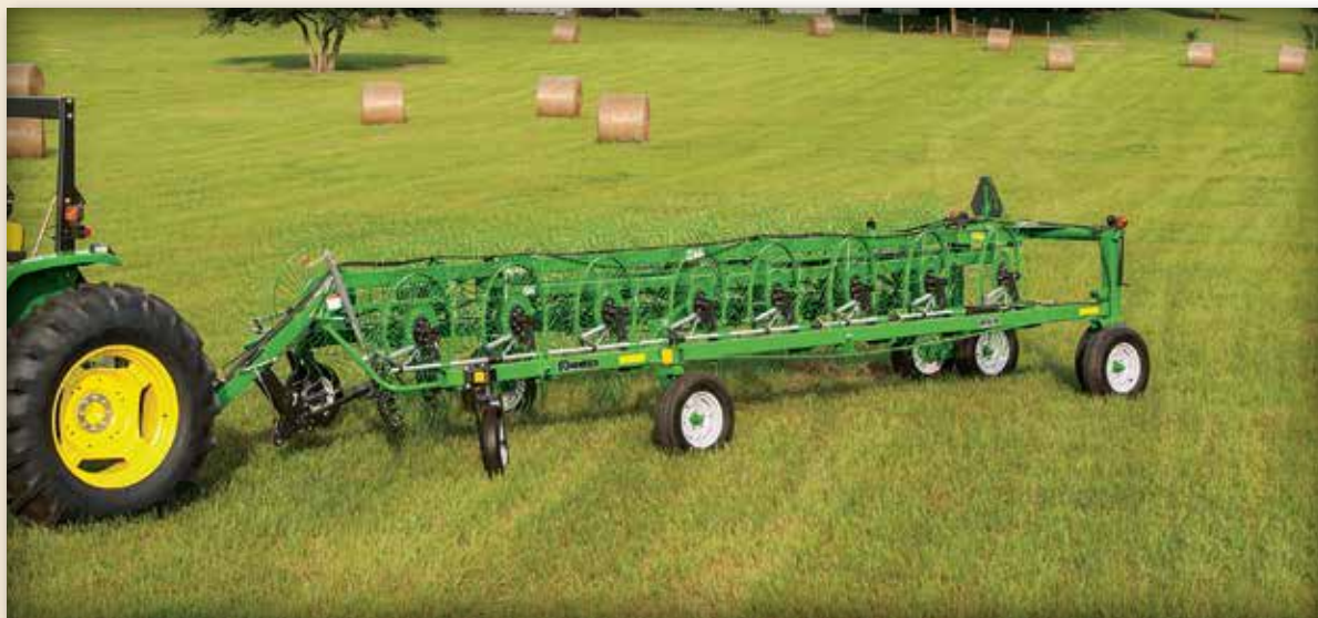
Frontier High-Capacity Rakes open and close hydraulically. Transport widths are 8 feet (2.4 m), making it easy to negotiate narrow roads and gates. Transport lights are standard on WR1214 and WR1216.